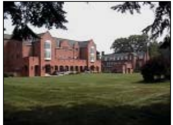
The Dixon University Center, a campus of six buildings, is the home of the Office of the Chancellor, the central headquarters for the Pennsylvania State System of Higher Education. Besides administrative offices, the Dixon University Center also has classroom space, conference facilities and a meeting room for PASSHE's Board of Governors.

The state universities spent the first 100 years of existence training teachers for Pennsylvania's schools. The Normal School Act of 1857 established regional teacher training institutions throughout the Commonwealth. The School Code of 1911 called for the state purchase of all normal schools, and by 1921 the current configuration of 14 state-owned universities was established. The 14 normal schools evolved from state normal schools, to state teachers colleges, to state colleges. On November 12, 1982, Act 188 was signed into law establishing on July 1, 1983, the Pennsylvania State System of Higher Education. Thus, the 13 former state colleges joined with Indiana University of Pennsylvania to achieve university status.