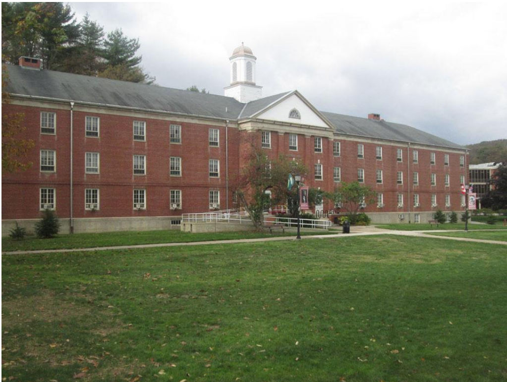
Russell Hall Lock Haven University of Pennsylvania