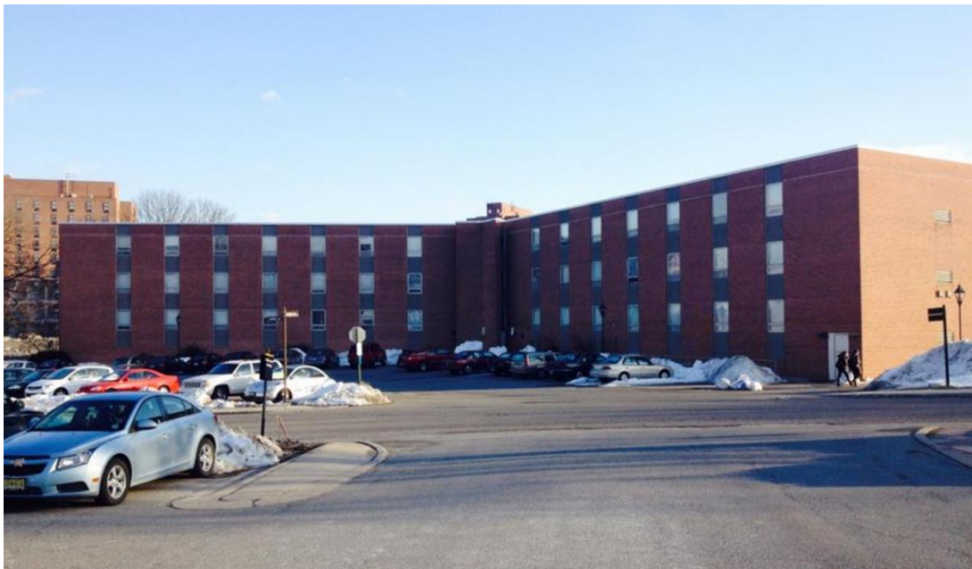
Hull Hall Millersville University of Pennsylvania