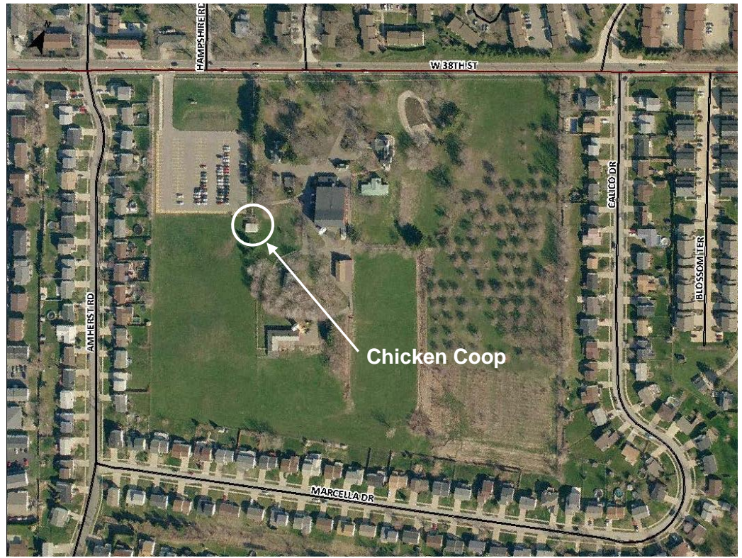
Porreco College (Erie Campus) Edinboro University of Pennsylvania