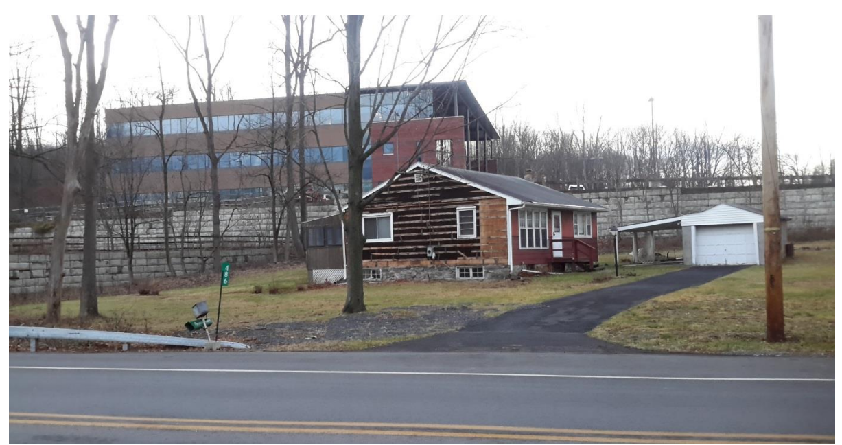
486 East Brown Street East Stroudsburg, Pennsylvania