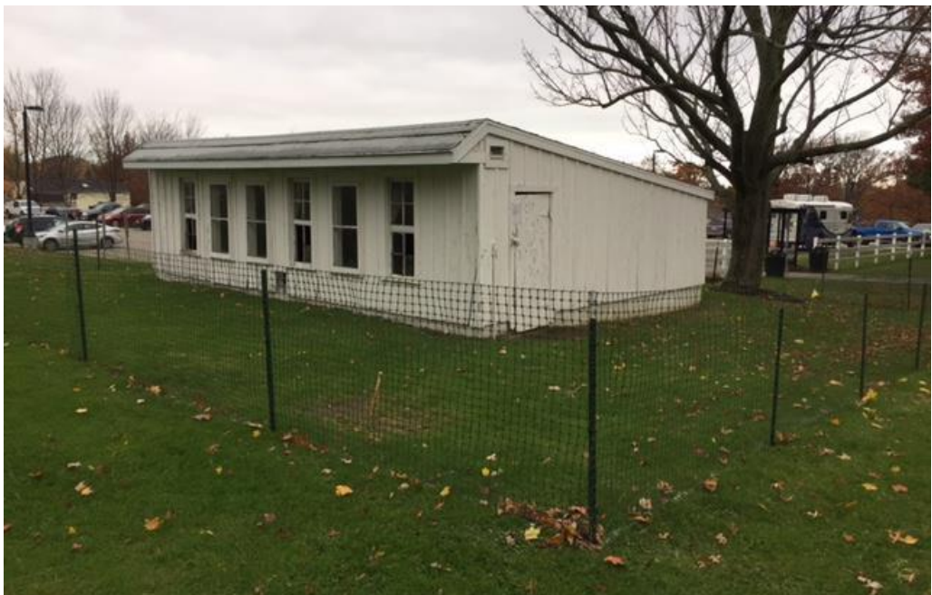
Chicken Coop Edinboro University of Pennsylvania