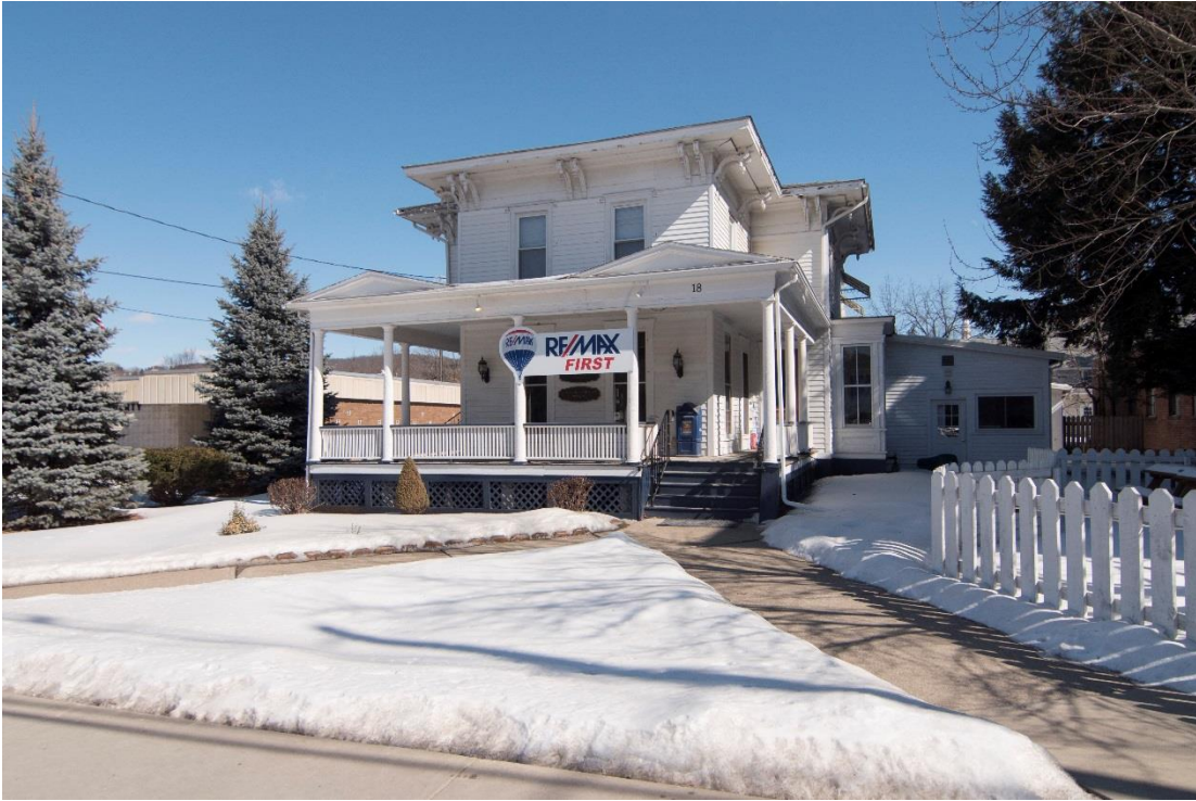
18 North Main Street, Mansfield, Pennsylvania