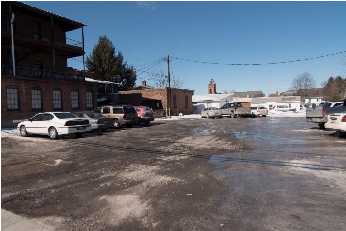
19 East Wellsboro Street, Mansfield, Pennsylvania