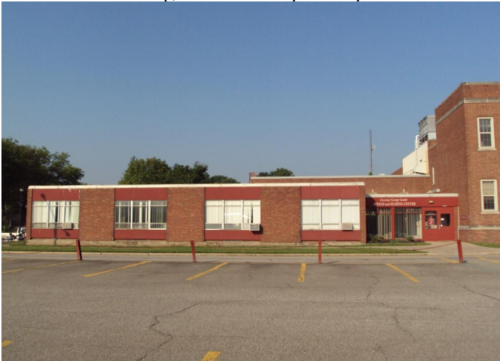
Speech and Hearing Center - Edinboro University of Pennsylvania