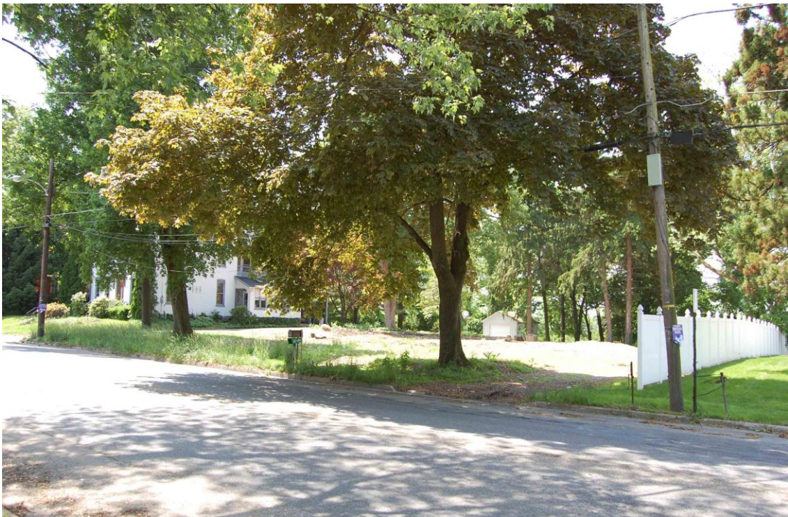
15183 Kutztown Road – Kutztown, Pennsylvania