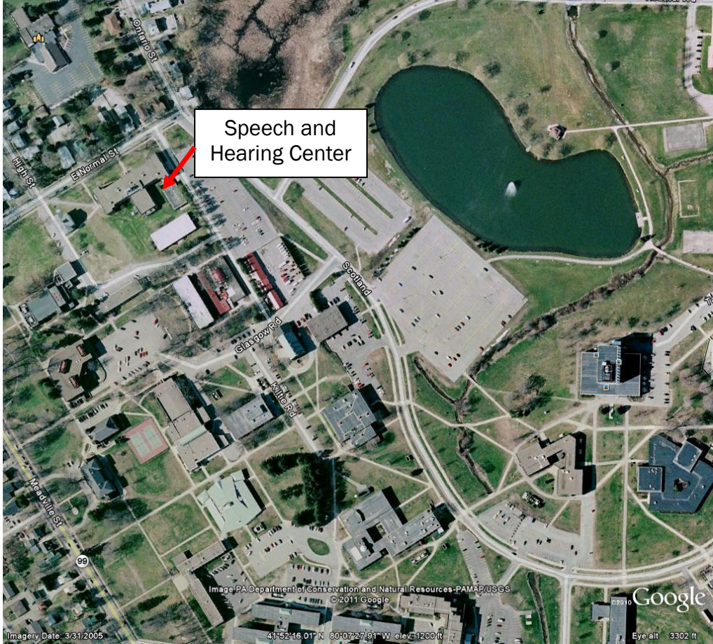
Partial Map, Edinboro University of Pennsylvania