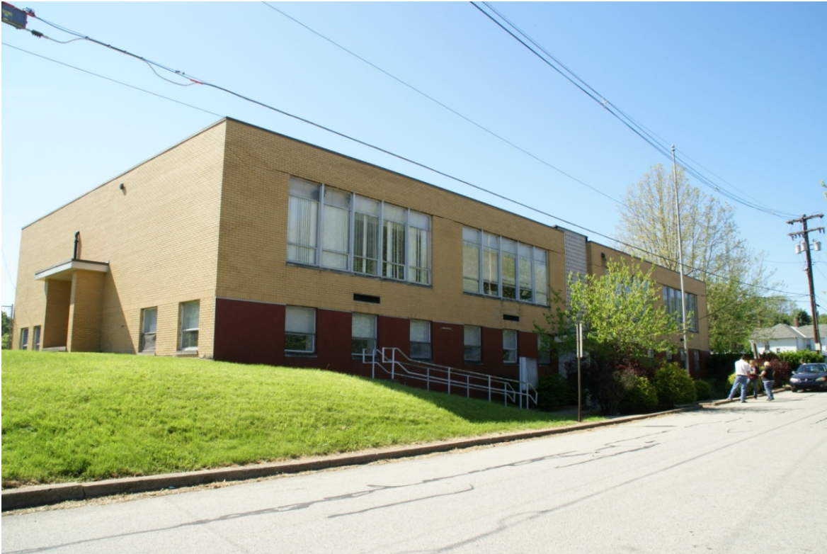
Main Office Building 750 Orchard Street, California, Pennsylvania