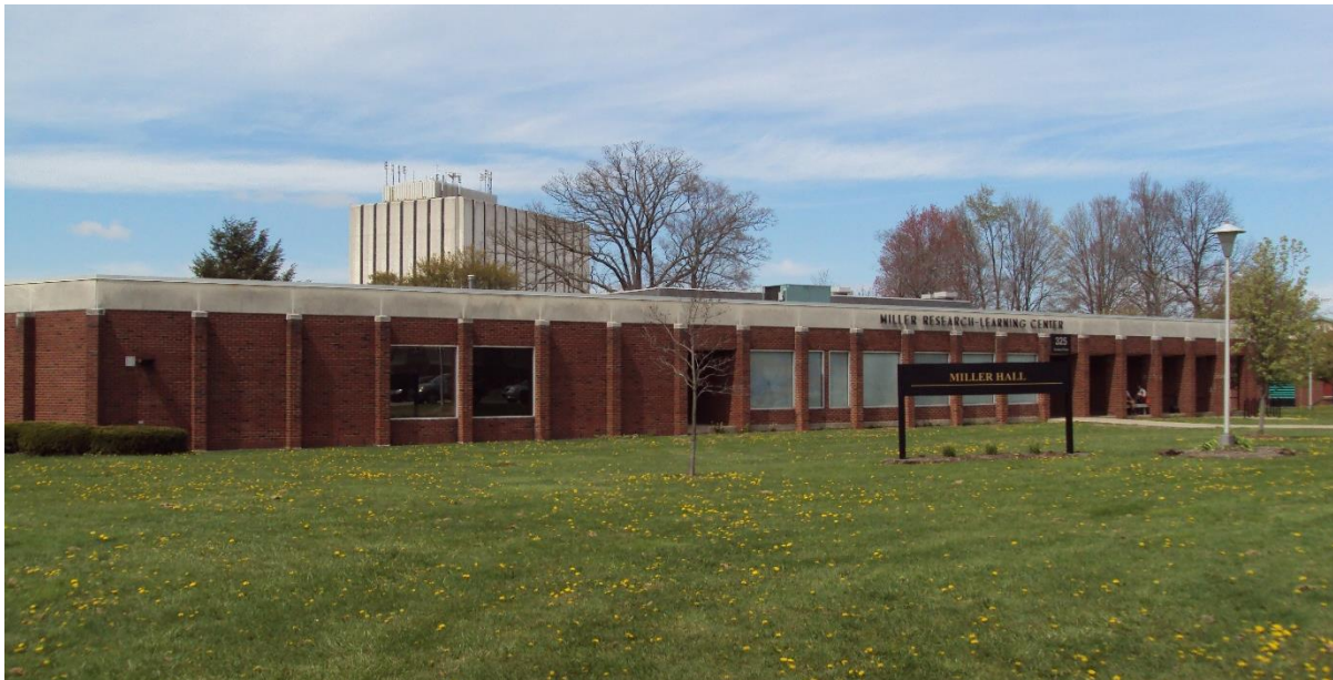
Miller Hall Edinboro University of Pennsylvania