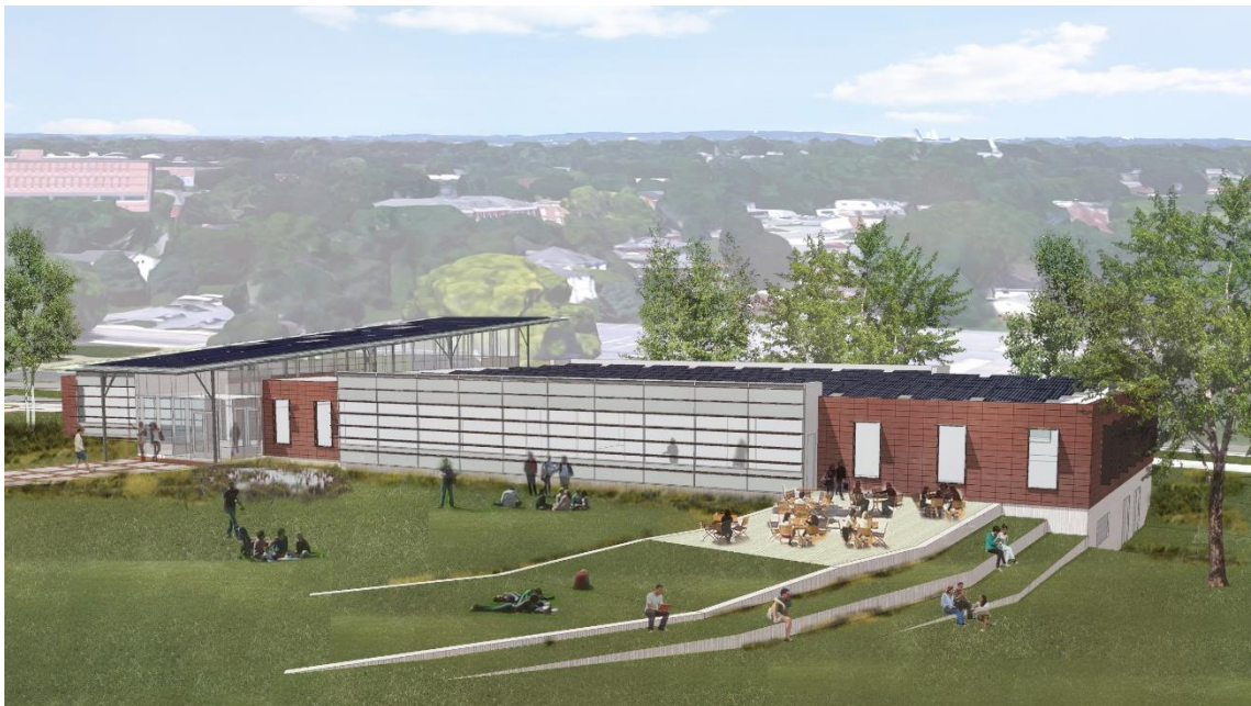
Welcome Center Rendering Millersville University of Pennsylvania