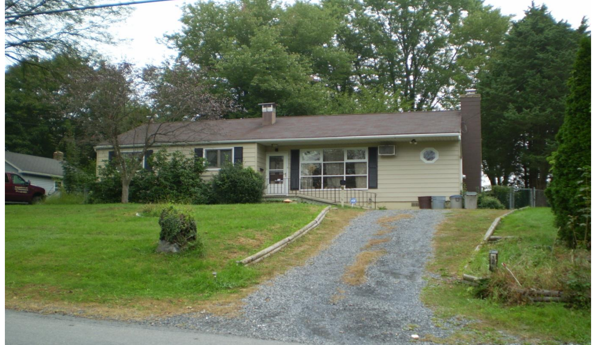
156 Marguerite Street, East Stroudsburg, Pennsylvania