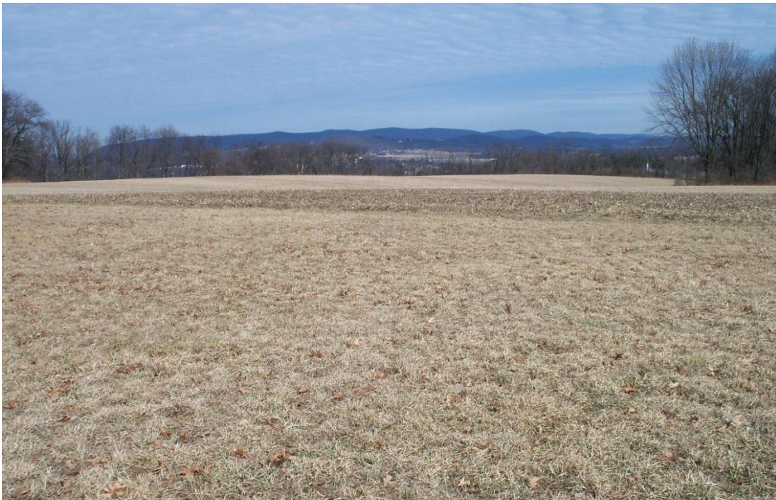
View of Property Facing East, Scott Township, Pennsylvania