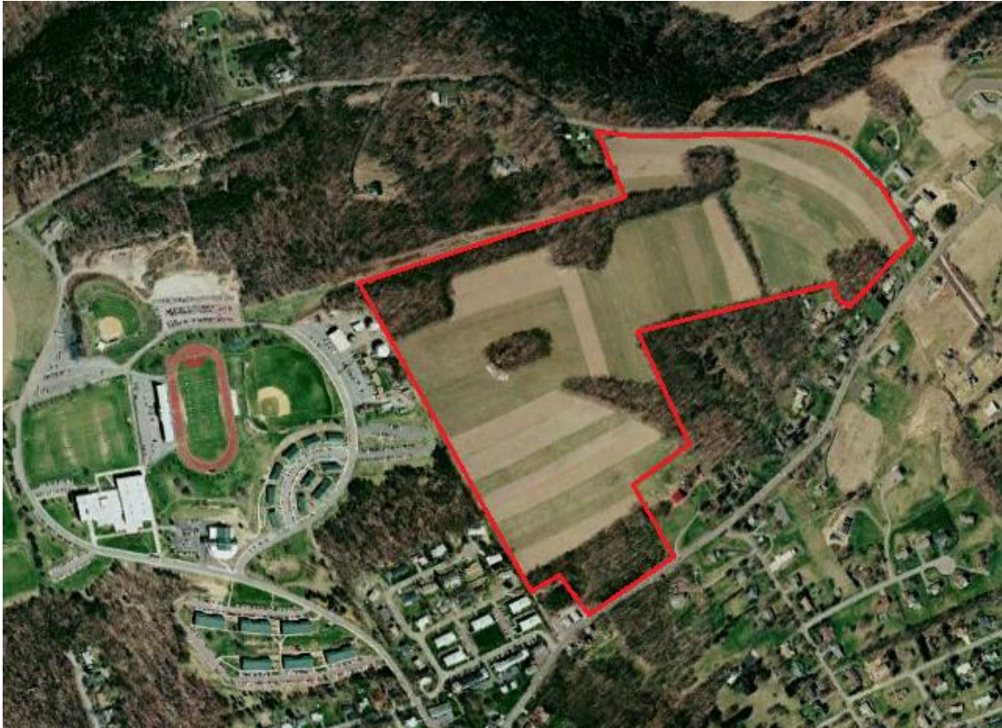
64 Acres Adjacent to Upper Campus