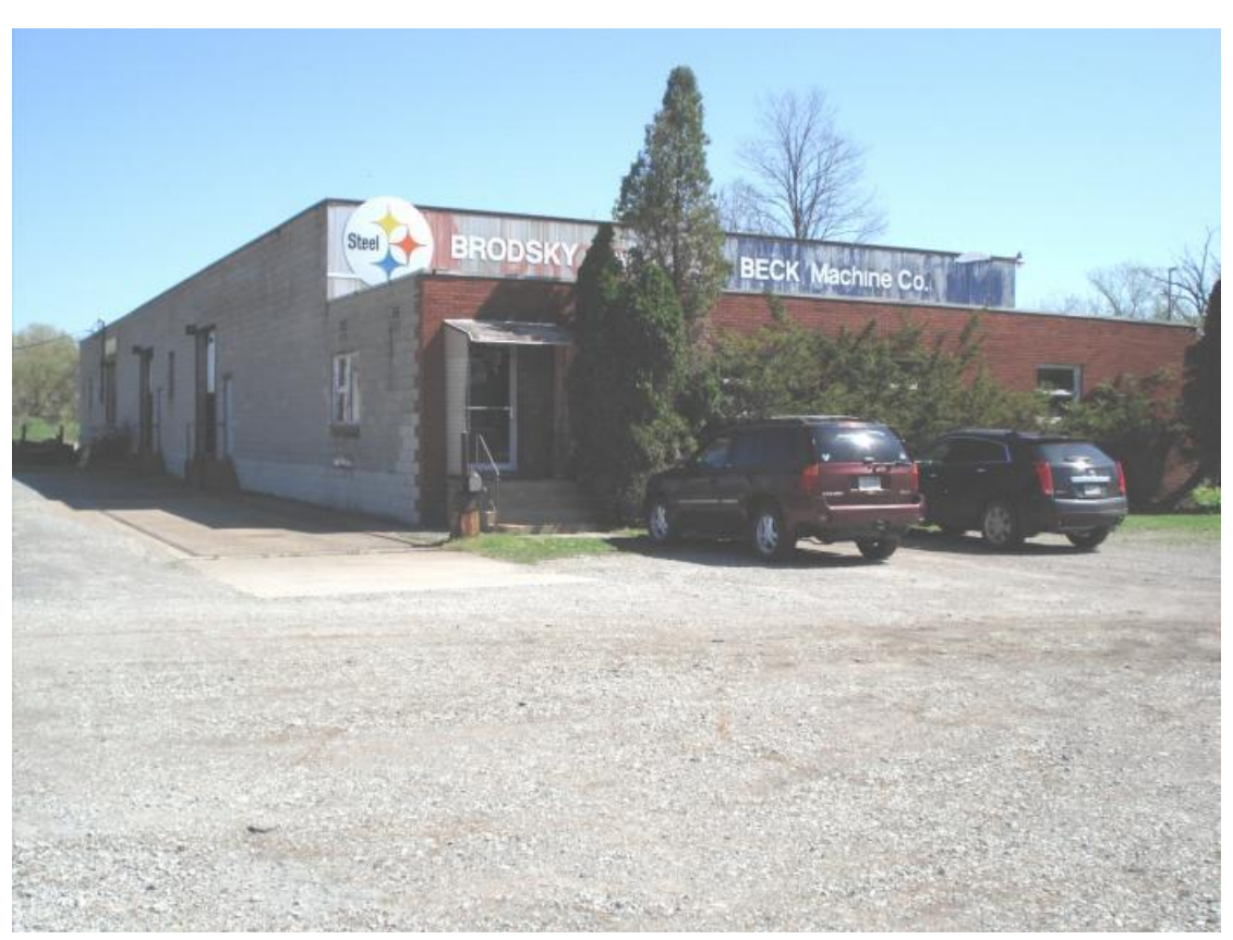
675 South 13th Street, Indiana, Pennsylvania