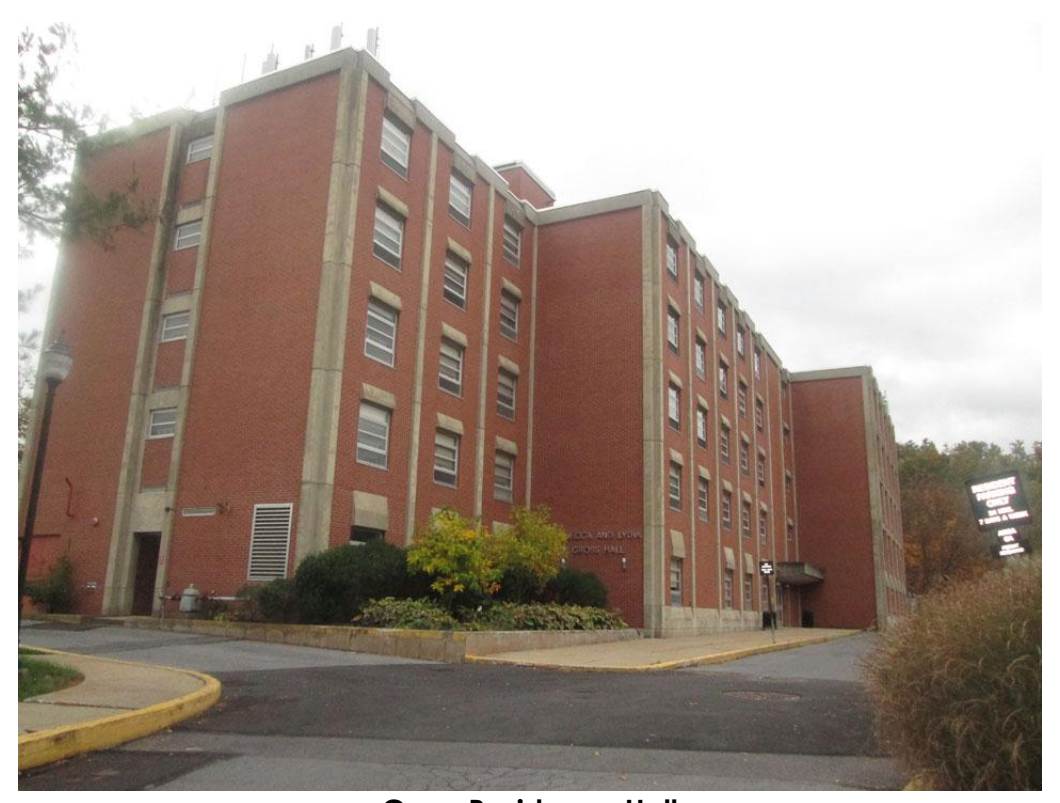
Gross Residence Hall