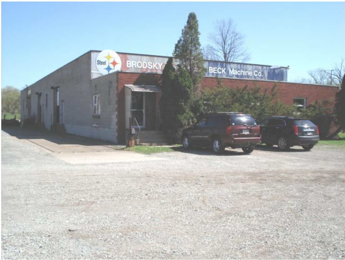
675 South 13 th Street, Indiana, Pennsylvania