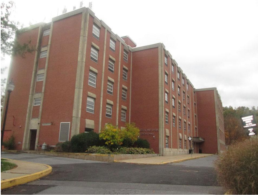
Gross Residence Hall