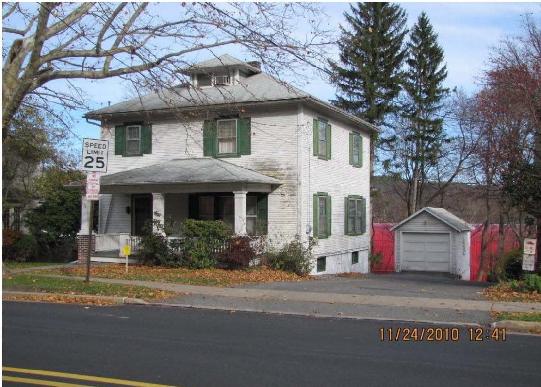
236 North Fairview Street, Lock Haven