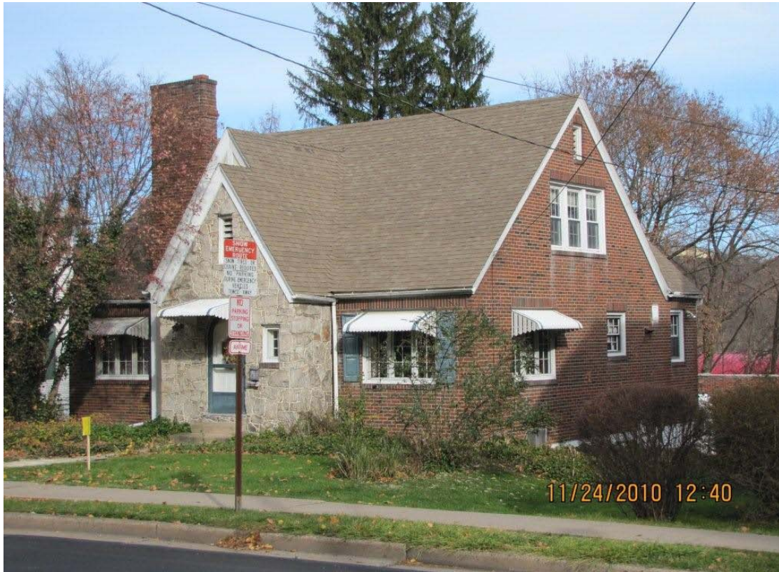
230 North Fairview Street, Lock Haven