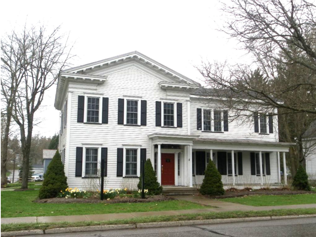
148 Meadville Street Edinboro, Pennsylvania