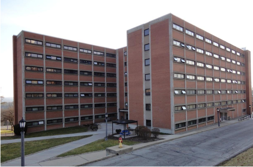
Nair Hall Clarion University of Pennsylvania