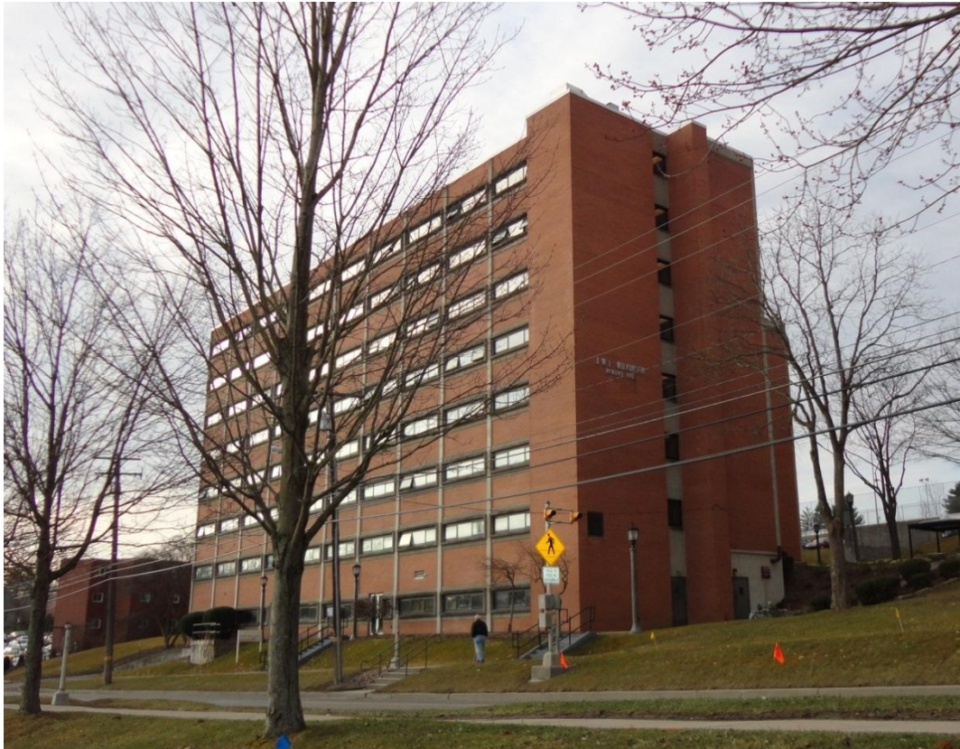
Wilkinson Hall Clarion University of Pennsylvania